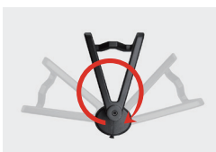
360° Swivel bar

The Underhood Light Series are versatile lights for use in automotive repair, construction, industrial and many other applications. These SMD LED lights provide 75% more luminescence compared to traditional fluorescent lights.