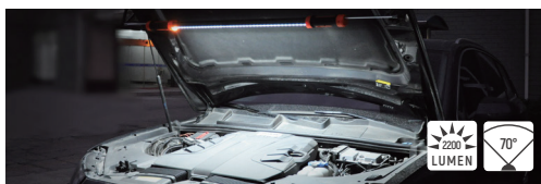
Bar extends from 49" to 83"