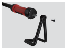
Detachable & replaceable bracket